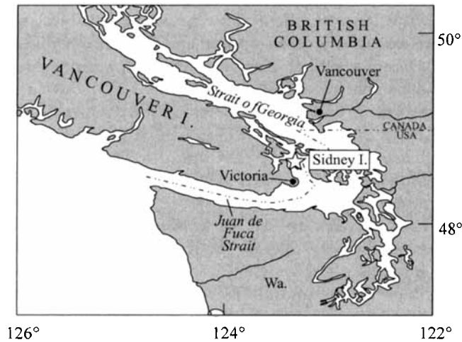
Figure 1. Harbor seal pups captured in a 10 × 15-km study area encompassing shallow intertidal shoals and small islands in region immediately southeast of Vancouver Island, British Columbia (48°6'N, 123°3'W).

minum boat equipped with a 30-hp outboard motor. Captures were made by hand or with the help of a large fish-landing net with 3-cm nylon mesh. One or two persons carried out the captures and wore protective clothing (knee and elbow pads, gloves, helmet, and life vest) to prevent injury on the slippery and rocky substrate at haul-out sites accessed during low tides. Pups were placed in nylon mesh nets during mass determination and were manually restrained for morphometric measurements. A blood sample was taken from the extradural vein using a Vacutainer system and an 18-g 3.2-cm needle (Becton Dickinson, Rutherford, U.S.A.). Blood was collected in heparinized Plasma Separation Tubes (Becton Dickinson) and stored at 4°C in the dark until processing at our laboratory within 4–8 h. Tubes were centrifuged for 20 min at 400 g, and the plasma was visually inspected as outlined below prior to storage for a concurrent developmental study of retinoid (vitamin A) physiology (Simms and Ross 2000).